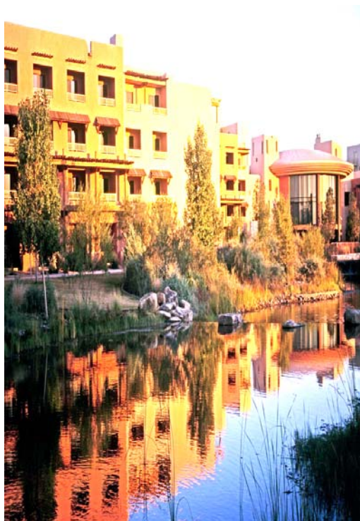
Sheraton Wild Horse Pass Resort

Seminars have been designed primarily for professionals in mental health, medicine and nursing, law, law enforcement, education, prevention, research, advocacy, child protection services, and allied fields. All aspects of child maltreatment will be addressed including prevention, assessment, intervention and treatment with victims, perpetrators and families affected by physical, sexual and psychological abuse and neglect. Cultural considerations will also be addressed.