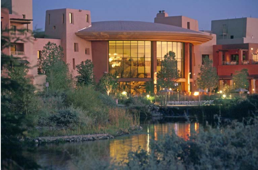
Sheraton Wild Horse Pass Resort – Phoenix, AZ