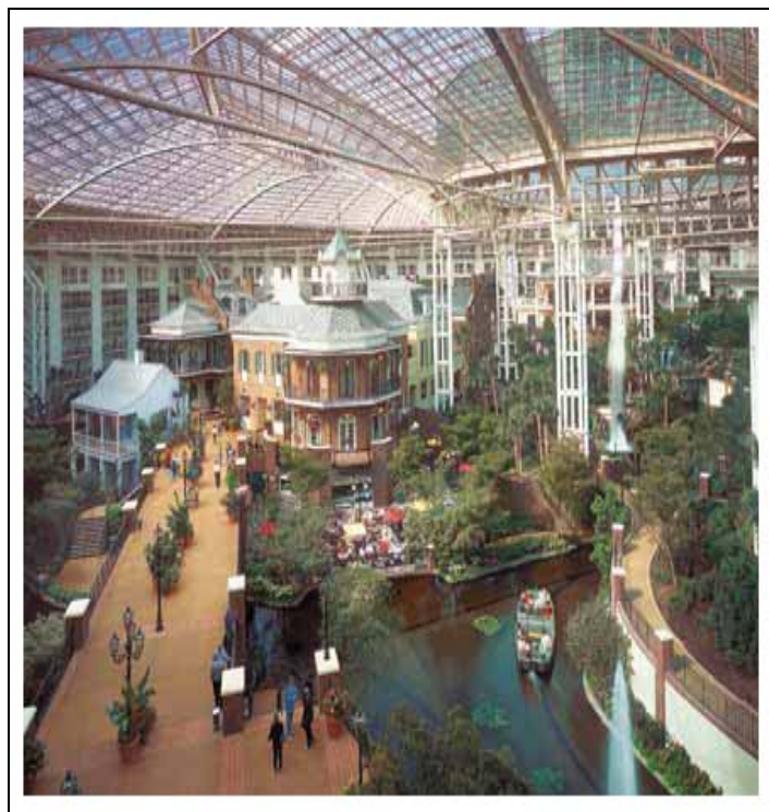
Inside the Atrium at Opryland

Seminars have been designed primarily for professionals in mental health, medicine and nursing, law, law enforcement, education, prevention, research, advocacy, child protection services, and allied fields. All aspects of child maltreatment will be addressed including prevention, assessment, intervention and treatment with victims, perpetrators and families affected by physical, sexual and psychological abuse and neglect. Cultural considerations will also be addressed.