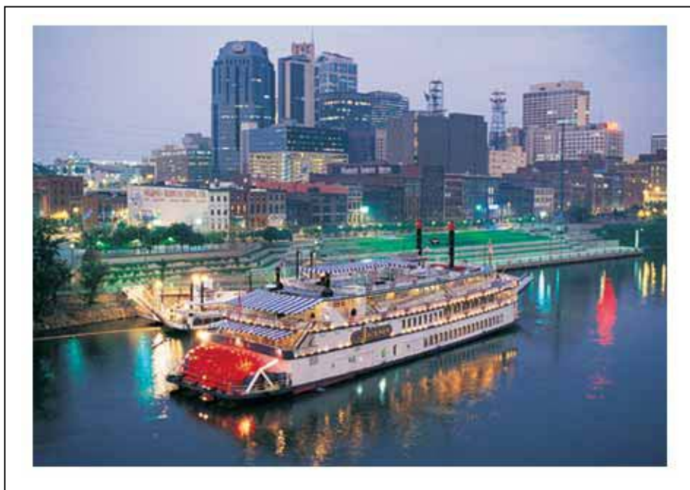
The General Jackson Showboat